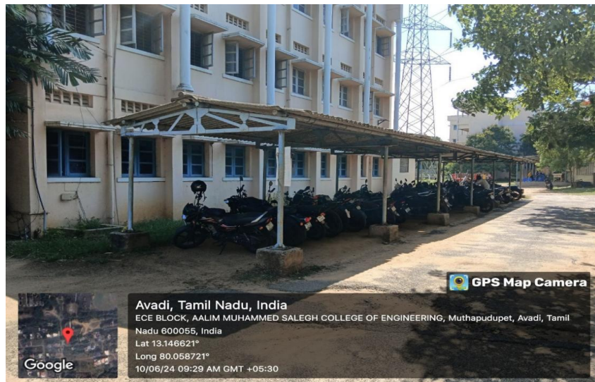
Figure: Two wheeler parking facility