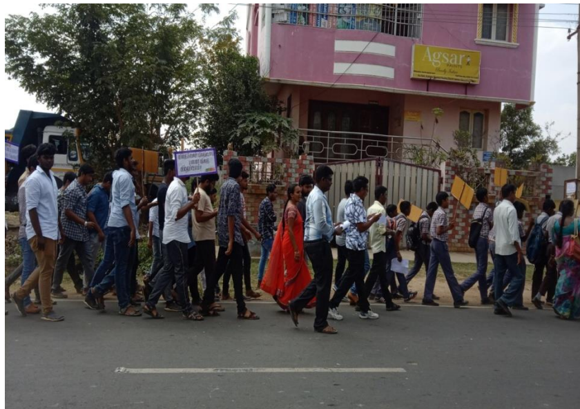
Figure: Eco awareness rally