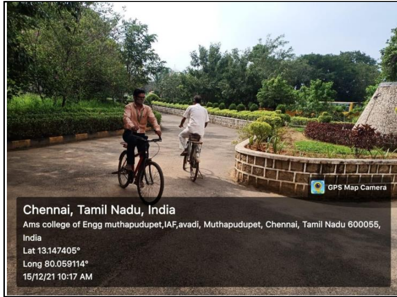
Figure: Use of bicycles by the college staff members

The students in the campus as well as in the hostels are using bicycles to use as a mode of transport within the campus to make campus pollution free