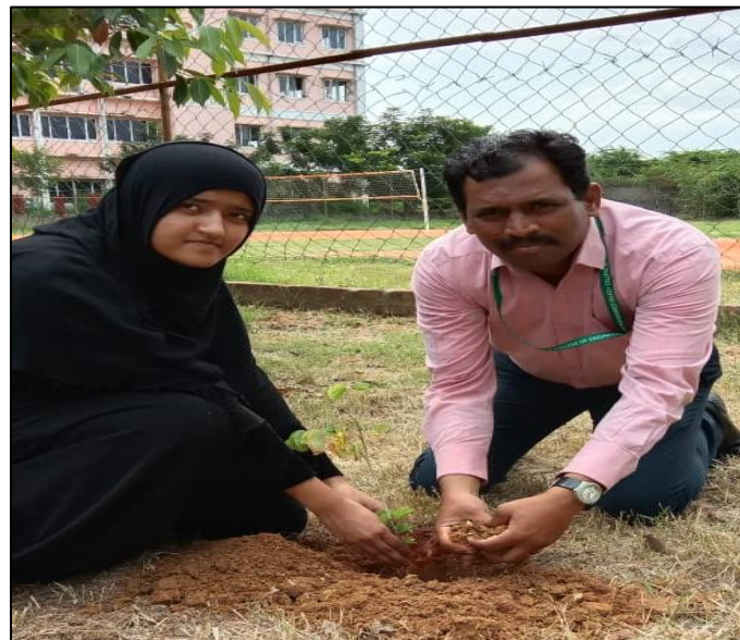
Figure: Student Planting Saplings in the college Campus