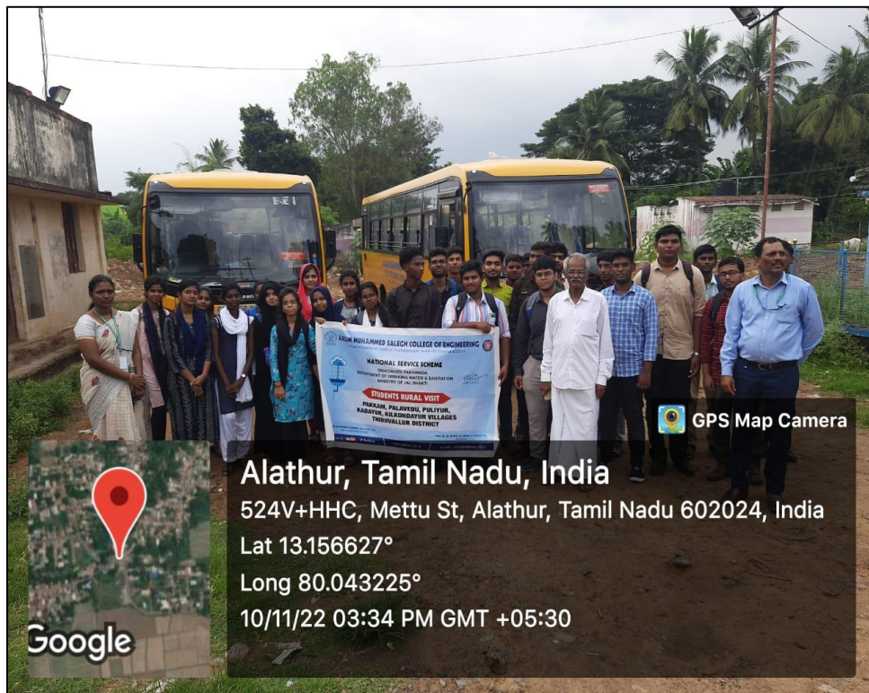
Fig: Student rural visit in Palavedu village, Tiruvallur Dist.

The students were taken to the villages adopted by Aalim Muhammed Salegh College of Engineering (under Unnat Bharat Abhiyan Scheme). The students were made to take Village Household Survey. The villages visited by our students were Palavedu, Pakkam, Puliur, Kadavur and Pandeswaram 10.11.2022 to 17.11.2022. The 270 students had a wonderful time interacting with the people living in the villages.