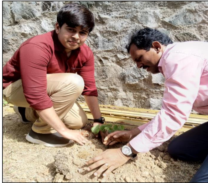
Figure: Student Planting Saplings in the college Campus

Approved by All India Council for Technical Education, New Delhi Affiliated to Anna University, Chennai NAAC Accredited Institution & NBA Accredited Courses (Mech. Engg., ECE, CSE, IT) "Nizara Educational Campus" Muthapudupet, Avadi-IAF, Chennai - 55.