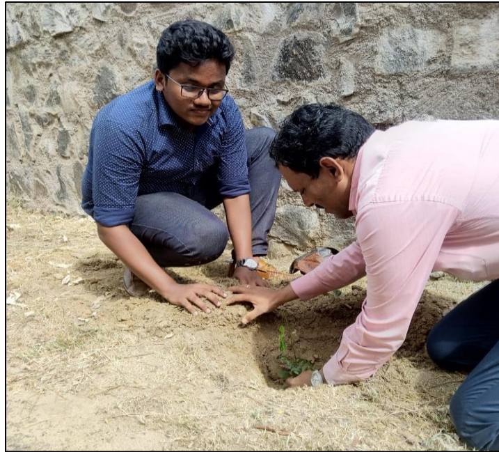
Figure: Student Planting Saplings in the college Campus

Approved by All India Council for Technical Education, New Delhi Affiliated to Anna University, Chennai NAAC Accredited Institution & NBA Accredited Courses (Mech. Engg., ECE, CSE, IT) "Nizara Educational Campus" Muthapudupet, Avadi-IAF, Chennai - 55.