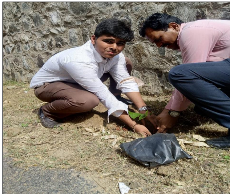
Figure: Student Planting Saplings in the college Campus