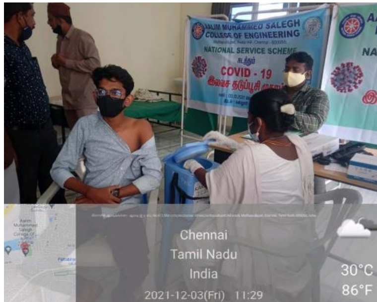
Figure: Vaccination camp