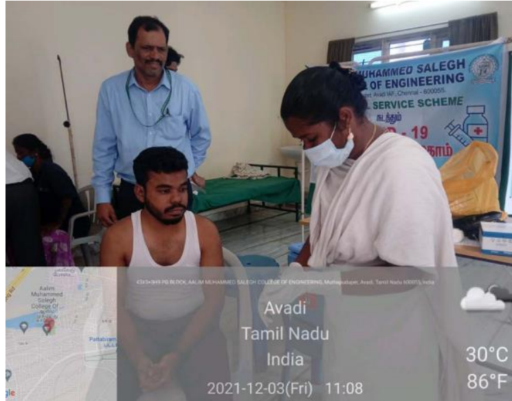
Figure: Vaccination camp

Aalim Muhammed Salegh College of Engineering organized a COVID-19 Mega vaccination drive on 03.12.2021 in the college campus. In the campaign 215 got vaccinated.