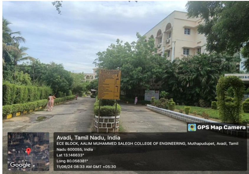
Figure: Parking Sign Board

The institute encourages the staff and students to use the vehicles with pollution check stickers to reduce environmental pollution.