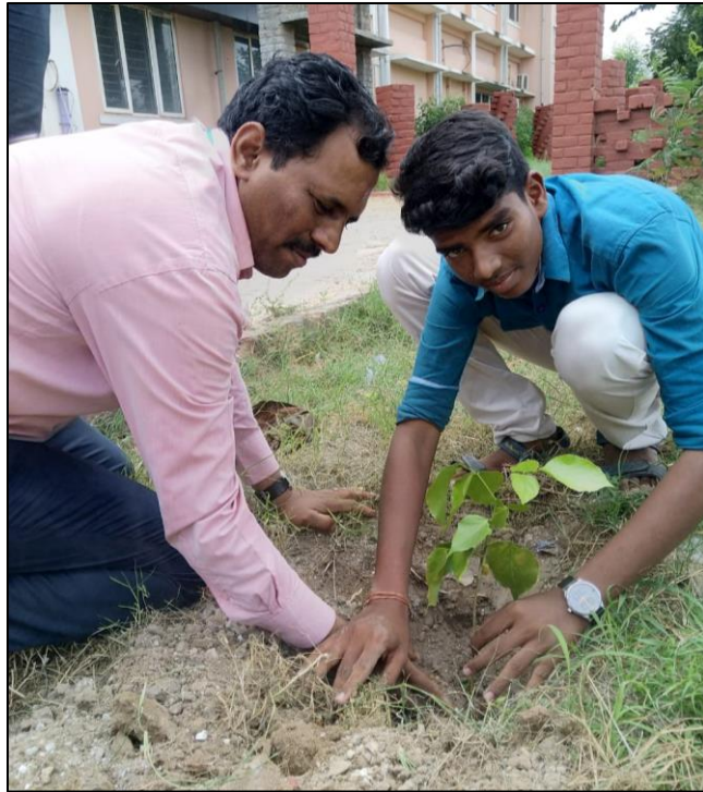
Figure: Student Planting Saplings in the college Campus

Approved by All India Council for Technical Education, New Delhi Affiliated to Anna University, Chennai NAAC Accredited Institution & NBA Accredited Courses (Mech. Engg., ECE, CSE, IT) "Nizara Educational Campus" Muthapudupet, Avadi-IAF, Chennai - 55.