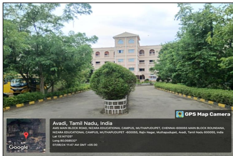
Figure: Beautiful landscape of the College

The College has a beautiful landscape with a mix of very old trees, middle aged trees, young trees or saplings and herbs and shrubs. The college gardens are well maintained through skilled and experienced persons.