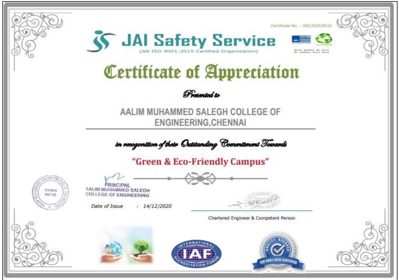
Figure: Certificate of appreciation

NAAC Accredited Institution & NBA Accredited Courses (Mech. Engg., ECE, CSE, IT) "Nizara Educational Campus" Muthapudupet, Avadi-IAF, Chennai - 55.