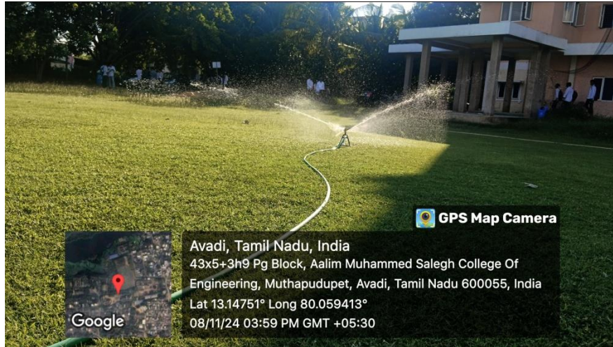
Figure: Water Sprinkler System at College cricket ground