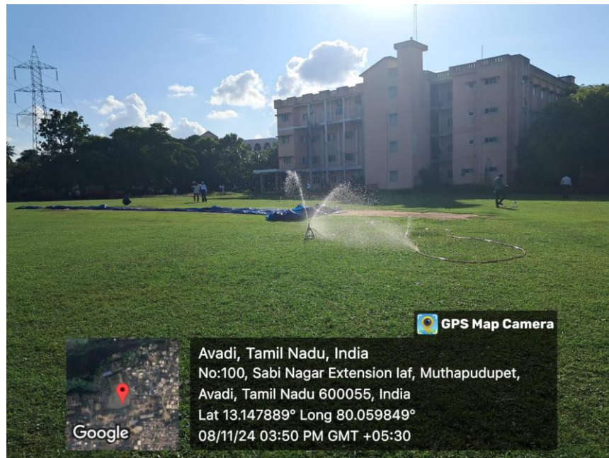
Figure: Water Sprinkler System at College cricket ground