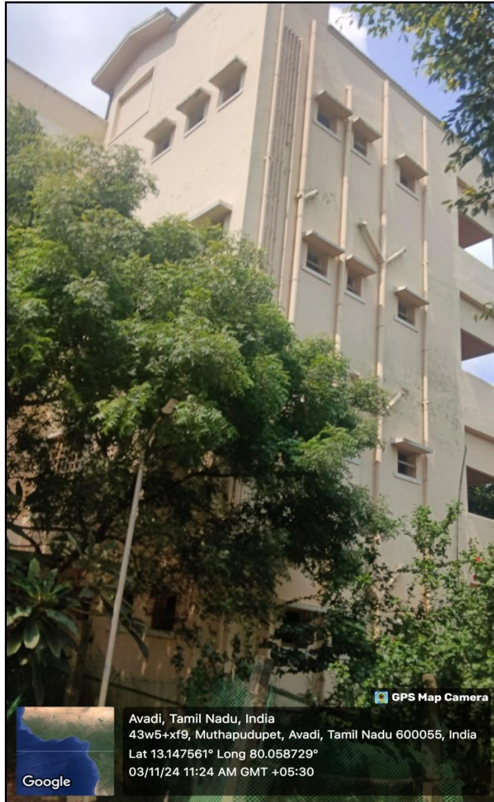
Figure: Water Distribution through Tanks in EEE building.

Approved by All India Council for Technical Education, New Delhi Affiliated to Anna University, Chennai NAAC Accredited Institution & NBA Accredited Courses (Mech. Engg., ECE, CSE, IT) "Nizara Educational Campus" Muthapudupet, Avadi-IAF, Chennai - 55.