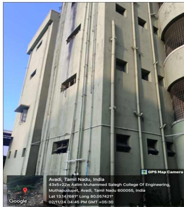
Figure: Water Distribution in Hostel buildings