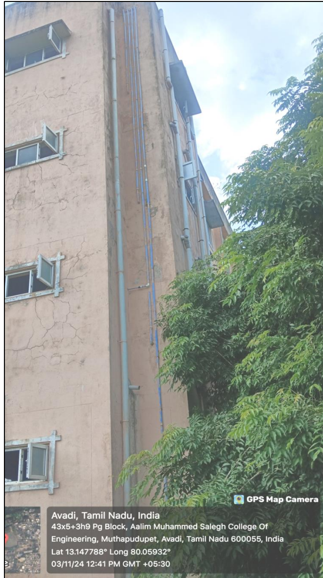
Figure: Water Distribution through Tanks in CSE&IT Block

Approved by All India Council for Technical Education, New Delhi Affiliated to Anna University, Chennai NAAC Accredited Institution & NBA Accredited Courses (Mech. Engg., ECE, CSE, IT) "Nizara Educational Campus" Muthapudupet, Avadi-IAF, Chennai - 55.