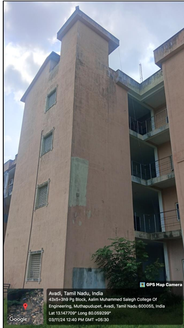
Figure: Water Distribution through Tanks in Basic Engineering Block

Approved by All India Council for Technical Education, New Delhi Affiliated to Anna University, Chennai NAAC Accredited Institution & NBA Accredited Courses (Mech. Engg., ECE, CSE, IT) "Nizara Educational Campus" Muthapudupet, Avadi-IAF, Chennai - 55.