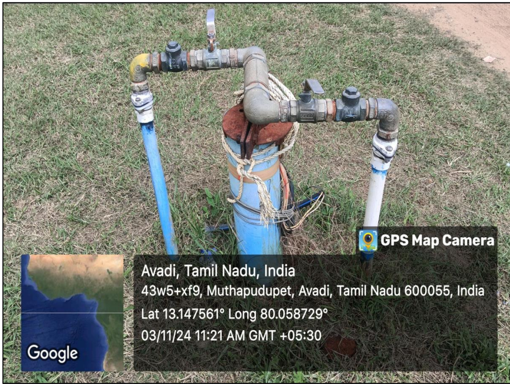
Figure: Bore wells