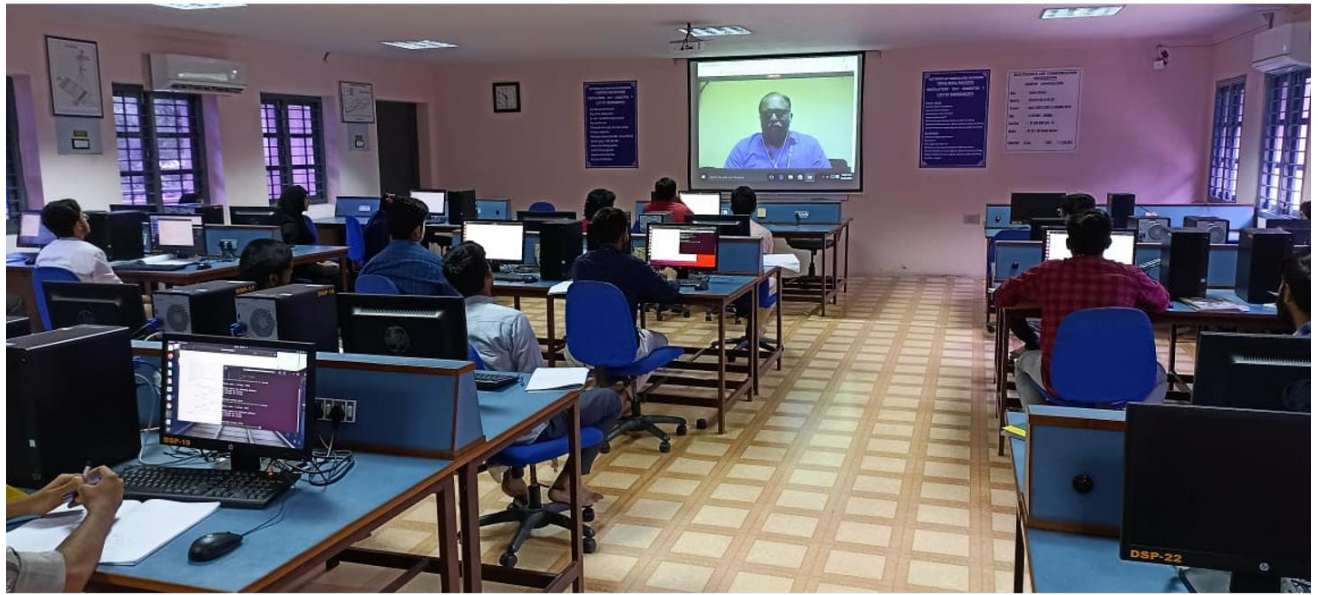
STUDENDS ATTENDING WEBINER (MAINTAINING SOCIAL DISTANCE AS PER SOP)